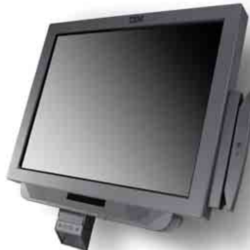
IBM AnyPlace Kiosk 19" with AMD processors