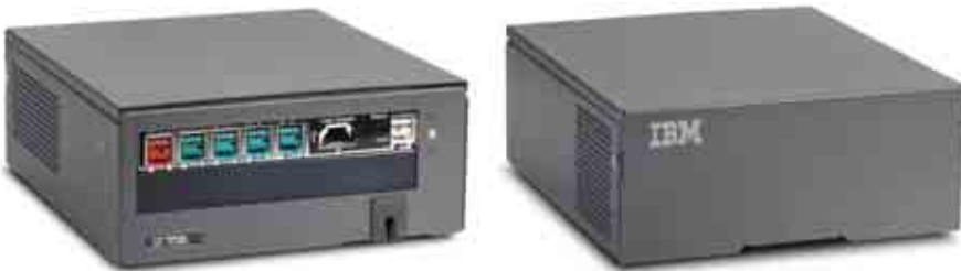
IBM AnyPlace POS Hub – back view and front view

IBM self-service systems are built to help companies expand and upgrade for a long life cycle, which can translate into companies disposing of fewer obsolete products. As part of IBM's commitment to developing products that reduce consumption of energy, IBM performance models use AMD mobile processors in the AnyPlace Kiosk. IBM entry level models use VIA processors with built-in power management that can help reduce system energy usage. The IBM worldwide packaging engineering team strives to use materials with recycled content and common shipping methods to help optimize the sustainability of packaging materials.