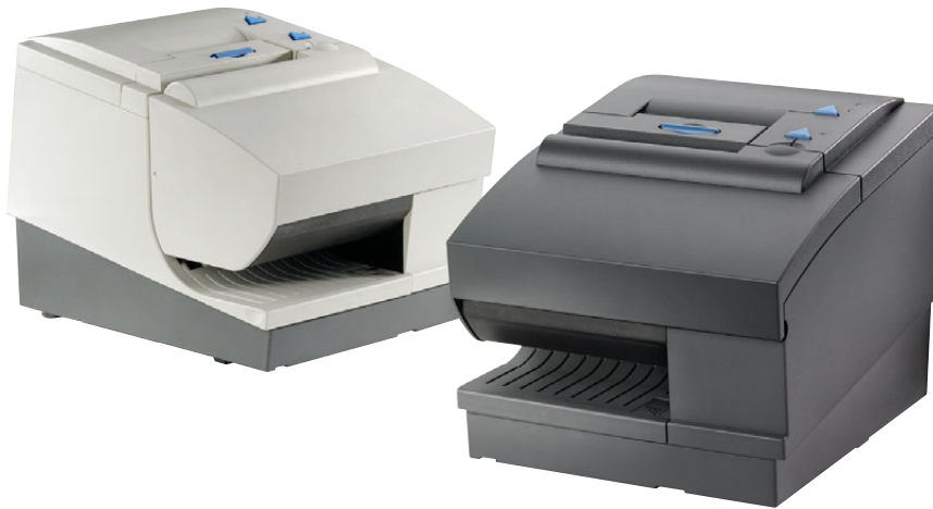
A new world standard for retail receipt printers