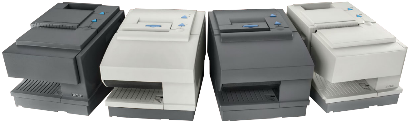
The family of SureMark dual-station printers. Models T19, TG9 and the new models 2CR and 2NR in pearl white and iron gray.